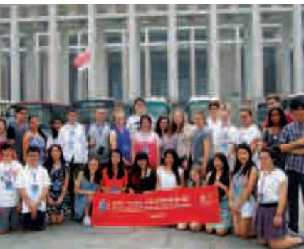
China summer camp