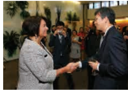
Minister of Education Hekia Parata with Chinese Ambassador HE Lutong Wang at a MLA farewell function at Parliament

Promotion of its cultural programmes sees the CI working closely with the New Zealand Centre for Literary Translation, the New Zealand School of Music, Te Papa (Museum of New Zealand