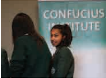
Students at a CI event

Apart from sending volunteer teachers, the CI regularly donates books and teaching materials to schools and local libraries, and provides opportunities for NZ students to visit China through summer camps and scholarships. In July 2013, the three CIs in New Zealand jointly organised a China Summer Camp for 100 NZ high school students, with special funding made available by Mme Liu Yandong, Vice Premier of China's State Council.