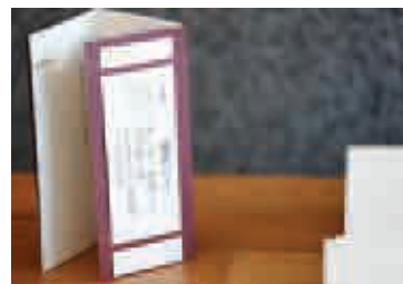
Te Papa launch of Li Bai poetry