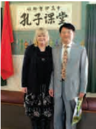
Confucius Classroom opening at Wanganui High School