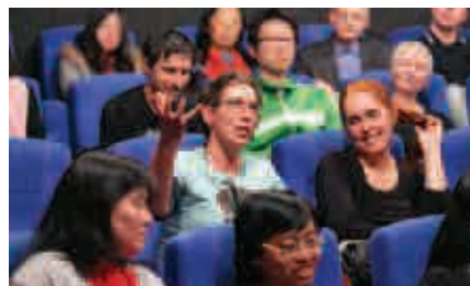
New Zealand Poet Hinemoana Baker at film discussion