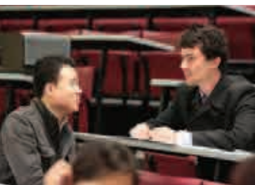
Chinese Language Buddies

In August 2013, the CI took over the management of Mandarin Corner from the NZ China Friendship Society and NZ Chinese Language Association (Wellington). Both organizations remain as supporters and promoters. The CI is now both the organiser and the sponsor of this weekly social gathering for Chinese conversation practice. The CI revamped the format and designed new publicity materials, and assembled a team of enthusiastic Mandarin Language Assistants as hosts and facilitators. These measures are paying off: attendance has been on the rise and feedback has been positive.