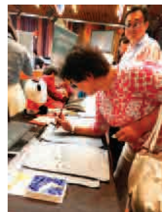
Calligraphy at the Chinese New Year celebrations at the Michael Fowler Centre

Hanban is supportive of CI sponsorship of traditional Chinese festival celebrations in the local communities. In 2014, we sponsored a range of Chinese New Year celebrations in Wellington and Palmerston North, and Mid-Autumn Festival celebrations at Capital Performing Arts (Wellington) and the Manawatu Chinese Community Trust (Palmerston North), as well as various other festival celebrations in Rotorua and Tauranga.