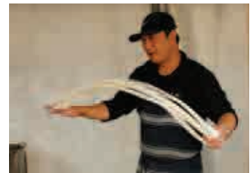
Noodle Making demonstration at CI Day 2014