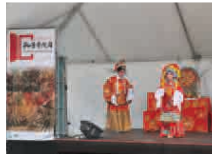
Cantonese opera performance at CI Day 2014