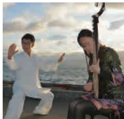
Two of the talented MLAs performing at the CI Day 2014 Sunrise Ceremony

In the lead-up to Chinese New Year 2015, CI VUW is collaborating with Asian Events Trust, a community group which has organised Chinese New Year festivities in Wellington for many years, to run special Discover Chinese New Year Festival workshops. Participating school and students will feature at the festival in February 2015.