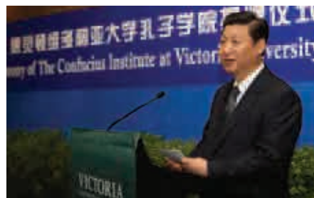
CI VUW was launched in Wellington by then Chinese Vice President Xi Jinping on an official visit to New Zealand in 2010.