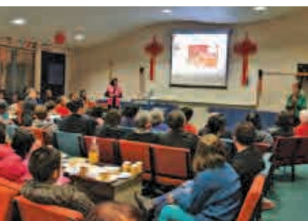
Mid Autumn Festival Celebration at Tauranga Girls' College Chinese Community School