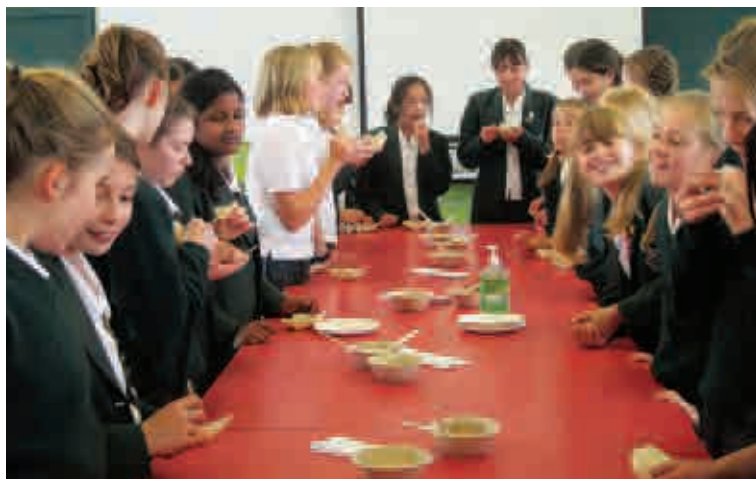
Dumpling making as part of CI Discover China workshop