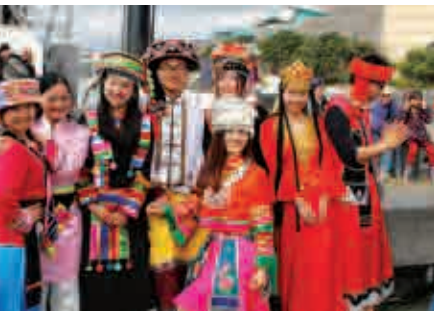
MLAs in ethnic costume for CI Day 2014