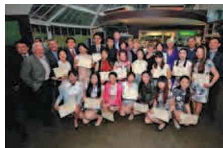
MLAs and the school principals and teachers

The cumulative achievements of the MLAs are noteworthy. In 2014, 21 MLAs worked with 37 schools in 11 districts. Together they provided a total of 995 language classes to over 7000 primary, intermediate, high school and tertiary students, almost doubling the numbers reached in 2013. This dramatic increase in scope and impact is largely due to the enhanced financial support from Hanban, pedagogical guidance, administrative support and pastoral care from local principals and teachers, and the dedication and hard work of the majority of the MLAs. The new group of MLAs for 2015 is likely to number around 38, to be placed in 71 schools.