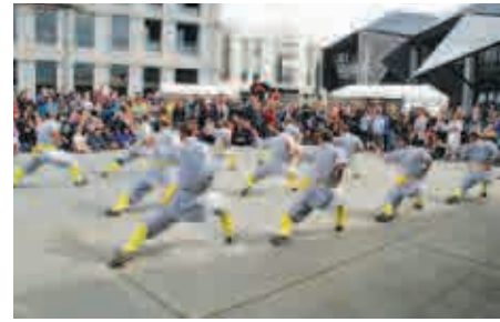
Shaolin Monks demonstration at CI Day 2014