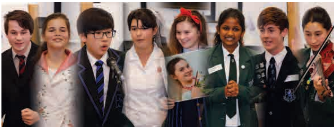
The many faces of the participants at the 2014 New Zealand National "Chinese Bridge" speech competition

CI VUW organized the Wellington Regional Speech Competition at Queen Margaret College in May for 50 competitors, and sponsored and supported the National Chinese Bridge Speech Competition at VUW, also in May, for 29 participants. In August CI VUW sponsored and supported the Rotorua Chinese Speech Competition (80 participants) and the Palmerston North Chinese Speech Competition in October (60 participants). These worthwhile events are a good incentives for language learners, together with attracting a total audience of close to a thousand people.