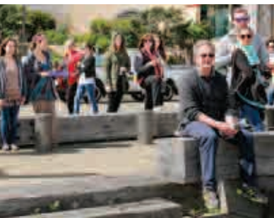
One of many casual audiences enjoying various performances on CI Day 2014

Music and drama, the visual arts, literature, and popular cultural events continued to significantly raise the profile of CI VUW in 2014. In particular, the China-New Zealand Music Exchange series continued with three major projects curated by Jack Body and delivered to acclaim, not only in Wellington but elsewhere in New Zealand: Tales from the Forbidden City (featuring composer-pianist Gao Ping), Asia Away and Beyond (featuring composer Jia Daqun), and High Mountain Flowing Water (featuring guqin virtuoso Wu Na, among others). The highlights are summarised below.