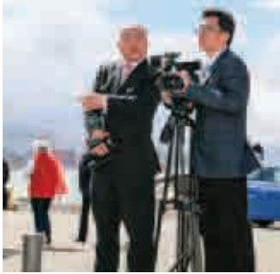
Chinese media in Wellington covering CI Day 2014