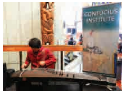
Guzheng performance at the Michael Fowler centre

Film continues to be a strong suit of CI VUW's arts programme, and film societies and festivals effective, readymade platforms to promote Chinese films and film-making. In 2014, we continued our sponsorship of New Zealand Film Society programmes, with 9 screenings of two Chinese films, Fallen City and The Vanishing Spring Light , in 6 cities. Both films were documentaries on contemporary issues in China: surviving the Sichuan earthquake and surviving old age.