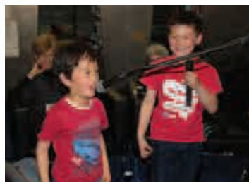
Children taking part in the CI Chinese poetry reading event