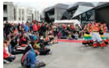
A crowd enjoying a performance on CI Day 2014