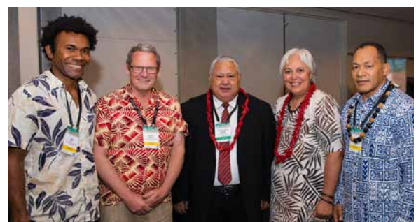
Hon. Tuila'epa Dr Sa'ilele Malielegaoi, Prime Minister of Samoa, centre, was the opening keynote speaker at the Pacific Climate Change Conference 2018.