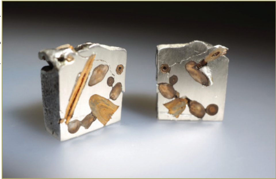
Paperweights, Andy Lee

Designers have an obligation to be socially and environmentally responsible. When designing new products and services, responsible designers take into account the impact of their work on people and the environment. For example, designers may consider whether the materials, natural resources and energy their products and services use are renewable. The quality and longevity of their product may be significant, and whether it is safe, ergonomic and devised to meet the needs of its users. Global initiatives in green manufacturing and eco-design promote the design of sustainable building, electronics, packaging and many other goods and services.