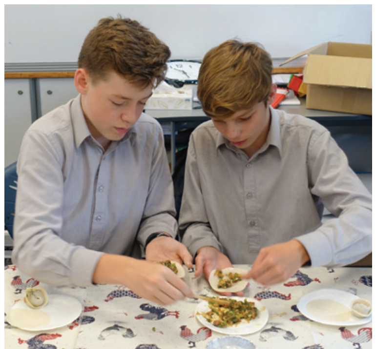
“Discover China”- dumpling making

Our Mandarin Language Assistants (MLAs) across the our region met the Chinese Language Week challenge with enthusiasm, holding a total of over 90 Discover China cultural workshops in schools around Wellington, Lower Hutt, Wairarapa, and Kapiti, New Plymouth, Tauranga, Palmerston North, Rotorua and Gisborne. Three MLAs also participated in a National Library panel on teaching and learning Chinese in New Zealand schools.