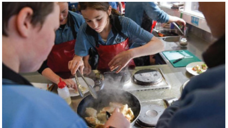
Cooking Dumplings Class at Evans Bay Intermediate School