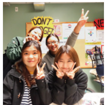
Mandarin Corner on Air program run by MLAs from CI Wellington