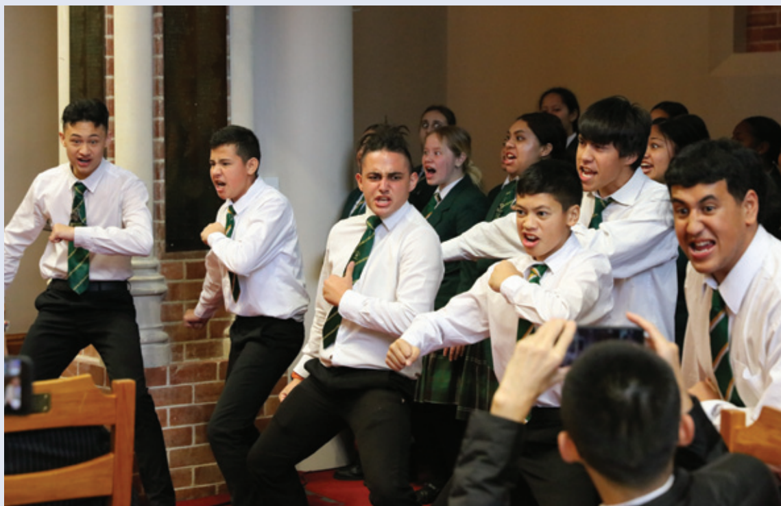
Kapa Haka from Whanganui High School at the Oceania Regional Conference, July 2019