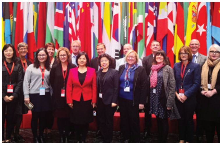
Principal delegation visiting Confucius Headquarters in Beijing

“It was useful to find out about education in China, about how our MLAs fit into the system and where they will be returning to... I consider the professional learning experience to be most worthwhile and would recommend it to any of our local principals who are able to attend.”