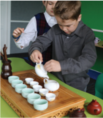
“Discover China”-Tea ceremony