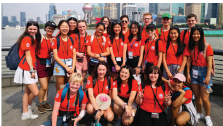
New Zealand Students visited Shanghai during the CI China Camp, October 2019

The CI led its first combined school camp to Xiamen and Shanghai in September/October catering for 21 students from 13 schools that could not run their own camp. Students from Tauranga, Kawerau, Te Awamutu, Rotorua, Palmerston North, Otaki and Greater Wellington gained an appreciation of modern China and enjoyed a unique language, culture and history experience. Throughout their course and school exchanges they were excellent student ambassadors for their schools and New Zealand.