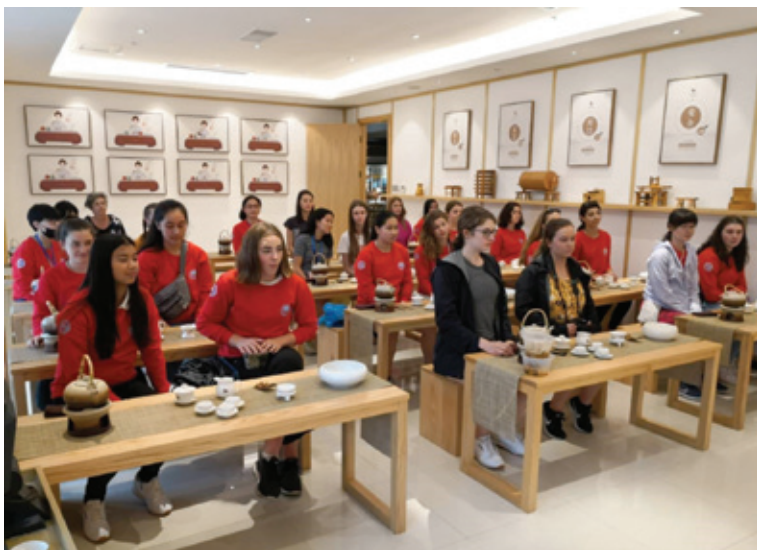
Students from Wellington East Girls' College having a tea ceremony session in China

Hanban provides specialised resources in the form of Confucius Classrooms to schools that have achieved a significant track record in introducing and teaching Chinese. There are over 1,000 Confucius Classrooms globally, with 28 in New Zealand, many of them operating as school-based hubs for Chinese teaching and learning.