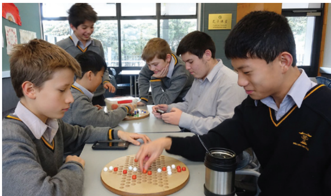
Wellington College Confucius Classroom

The Institute has ten Confucius Classrooms in our region. We congratulate these leading schools as models and support to others in their catchments: Rotorua Boys' High School, Whanganui High School, Wellington College, Wellington Girls' College, Wellington East Girls' College, Tauranga Intermediate