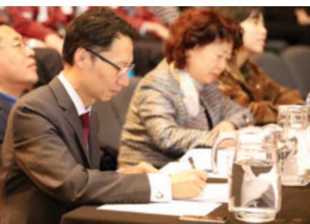
Judges of the 2019 Chinese Bridge Competition