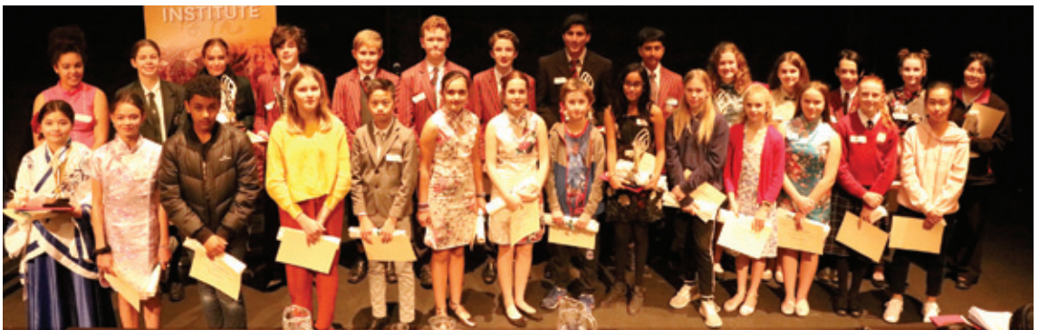
Group Photo for the Junior group (top) and the Senior group (below) of the Wellington Regional Competition

Speech competitions provide a great incentive for students to improve language fluency and help build interest in language and culture. In June the CI held the 2019 “Chinese Bridge” regional competitions for a record number of 71 contestants from 20 schools in the lower half of the North Island, and from Victoria University of Wellington, competing across the three academic categories of junior and senior high school and university.