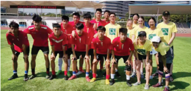
New Zealand Students soccer game with the local Xiamen students during the CI China camp

The CI led its first combined school camp to Xiamen and Shanghai in September/October catering for 21 students from 13 schools that could not run their own camp. Students from Tauranga, Kawerau, Te Awamutu, Rotorua, Palmerston North, Otaki and Greater Wellington gained an appreciation of modern China and enjoyed a unique language, culture and history experience. Throughout their course and school exchanges they were excellent student ambassadors for their schools and New Zealand.