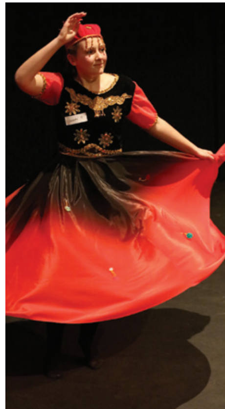
Dancing at Chinese Bridge Competition

The Institute further sponsored the successful 18 th Rotorua Inter-Schools Chinese Speech Competition. Speech competitions remain very popular fixtures with language learners.