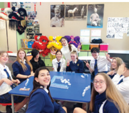
Wellington East Girls' College Confucius Classroom