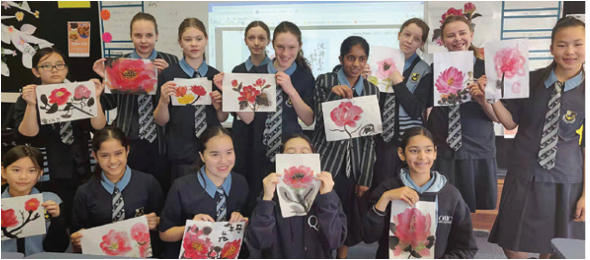
“Discover China” - Chinese painting

Complementing language classes in schools are the Institute’s extremely popular Discover China! workshops. In 2019, the CI held over 340 workshops. These interactive sessions showcase the talents of MLAs and of our team of skilled instructors: Ping Ching Mabbett (calligraphy and painting); Meng Fanxiao (wushu martial arts); Grace Chiu (dumpling making); Kong Jingyuan; Ling Jia (Chinese traditional Instrument) and Li Haibo (dance).