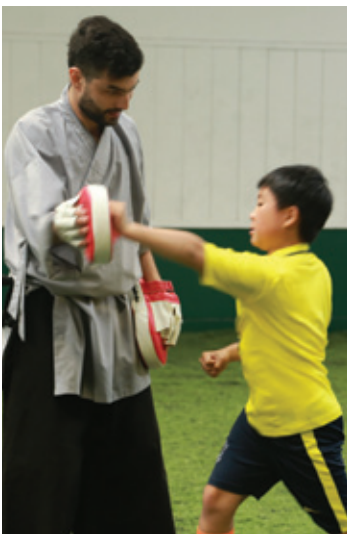
Martial Arts Instruction at Te Aro School