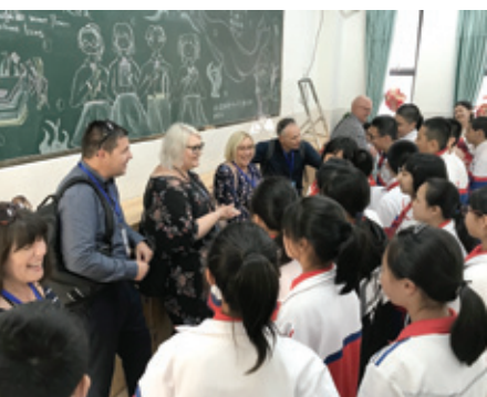
Principal delegation visiting a middle school in Xiamen