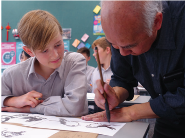
“Discover China”- Calligraphy