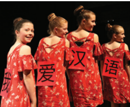
I Love Chinese, Morrinsville Intermediate School