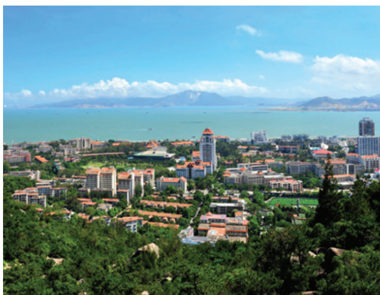
Xiamen University is our partner in Wellington's sister city Xiamen

In July our CI successfully hosted the Oceania CI Regional Meeting at the University. More than 60 participants from 23 New Zealand, Australian and Pacific Institutes and senior leaders from Hanban and Xiamen University attended the annual Australia, New Zealand and Pacific Islands Confucius Institute Conference. We involved student and school representatives from our network who presented on the opportunities provided