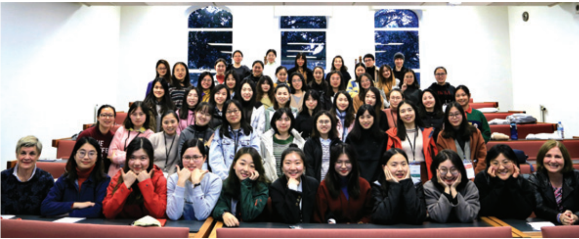
New Zealand’s Mandarin Language Assistants across New Zealand (above) and Wellington (below) at national training in Auckland, July 2019

In July, Mandarin Language Assistants and Hanban teachers from across the country headed to Auckland for three days of workshops and presentations on a diverse range of topics including language teaching and acquisition, cross-cultural