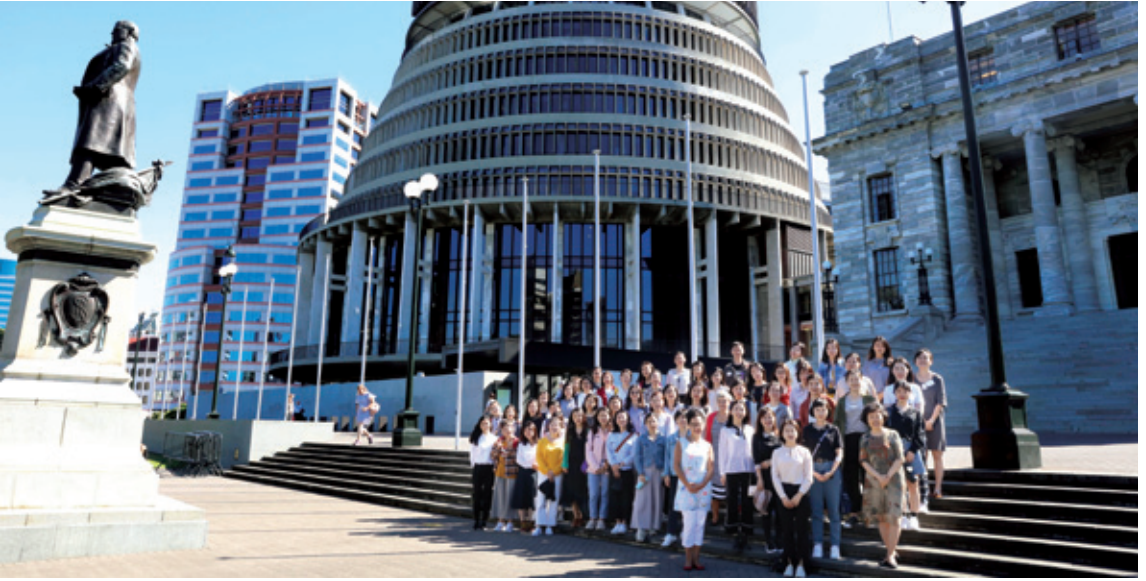
2019 MLAs in front of New Zealand Parliament