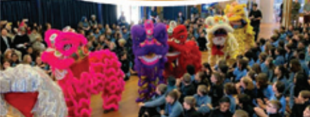
“Discover China” event in Evans Bay Intermediate School

The Confucius Institute continues to play an active role in supporting this Kiwi-led initiative aimed at encouraging New Zealanders to discover Chinese language and culture.