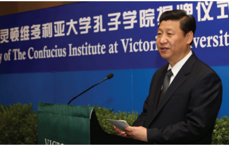
Chinese President Xi Jinping (then Vice President) launching CI Wellington in June 2010

part of the worldwide network of over 500 Confucius Institutes operating with financial backing and support from Confucius Institute Headquarters, Hanban (汉办), in Beijing.