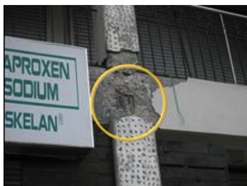
Figure 8. An example of improper rebar works in Market Building in Loon: (Left) Failures at panels, (Right) Detail of damaged part.