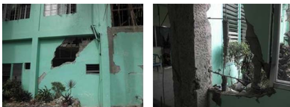
Figure 6 An example of poor quality of concrete hollow blocks (CHB). (Left): Damaged non-structural walls in Municipal Office of Catigbian. (Right): Details of a damaged wall.