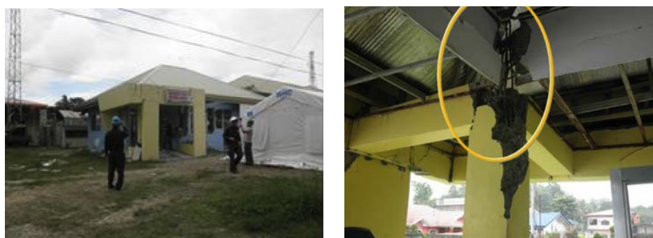
Figure 4. An example of improper structural design. (Left): Exterior view of District Health Care Center of Sagbayan, (Right): connection of a column and beams.