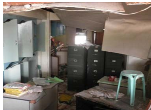
Figure 1. Municipal building of Sagbayan, Bohol. (Left): Heavy damage to partition walls and other elements, and (Right): inside the buildings.