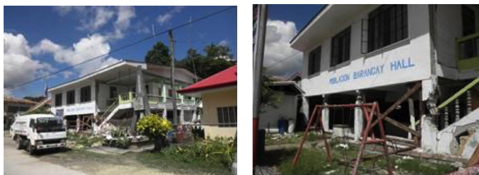
Figure 5. An example of improper structural design in Barangay office in Antequera. (Left): exterior view, (Right): damaged columns by irregular configuration.