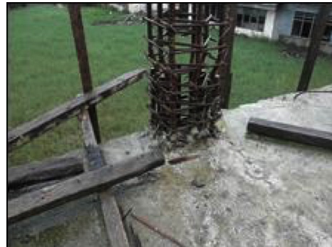
Figure 10. Examples of improper rebar works: (left) Barangay Office in Antequera, (Right) A building under construction, Basesy National High School.