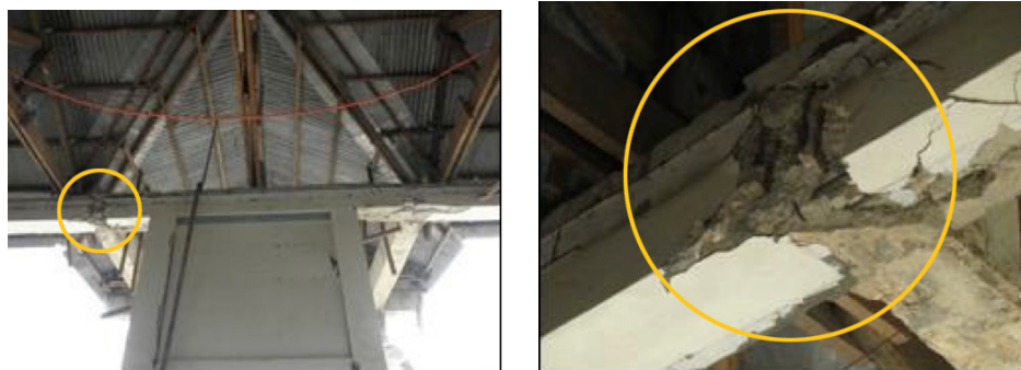
Figure 3. An example of improper structural design in Municipal building of Sagbayan, Bohol (For exterior view: refer to Figure 1). (Left): damaged connection of beams of canopy and main structure, (Right): Detail of the damage.