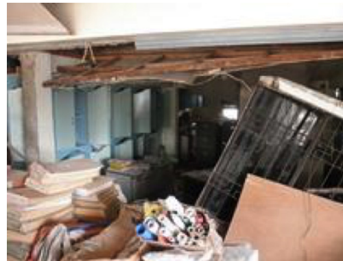
Figure 2. Huge differences in damage among municipal buildings of Antequera and Sagbayan, Bohol. (Upper left): Municipal office of Antequera (Building 2). (Upper right): First floor. (Lower left): Municipal office of Sagbayan. (Lower right): Interior view of Lower left.

structural members. Huge differences in the degrees of damage were observed. Figure 2 shows differences among municipal buildings of Antequera and Sagbayan, Bohol. Upper left photo shows the Municipal office of Antequera (Building 2). It suffered little and the upper right shows the conditions of the first floor of the upper left that enabled it to start operation soon after the earthquake. The lower left photo shows the exterior view of the Municipal office of Sagbayan. Lower right photo shows heavy damage to non-structural members such as partition walls and ceilings while damage to the structure was limited. This building will be demolished due to the damage.