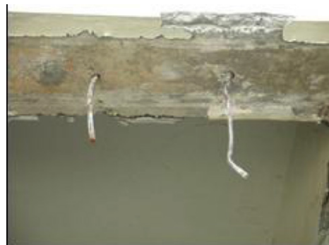
Figure 11. Examples of improper anchorage of CHB walls to RC members in Market Building of Loon: (Left) a case of horizontal rebar, (Right) a case of vertical rebar.