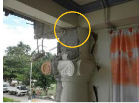
Figure 9. Examples of improper concrete placing: (left) Market Building in Loon, (Right) Sagbayan Municipal Office.