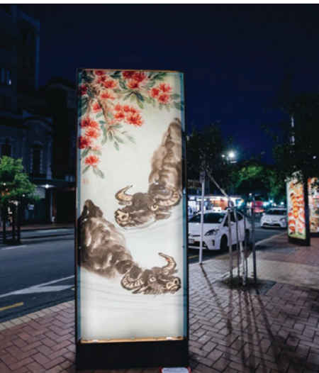
Street art projects by Stan Chan