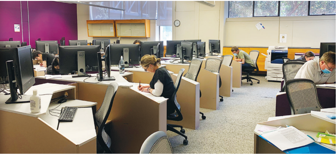
Students taking the HSK language proficiency test at Victoria University of Wellington in November

4. Students find these particularly helpful for when they plan to sit an HSK test.