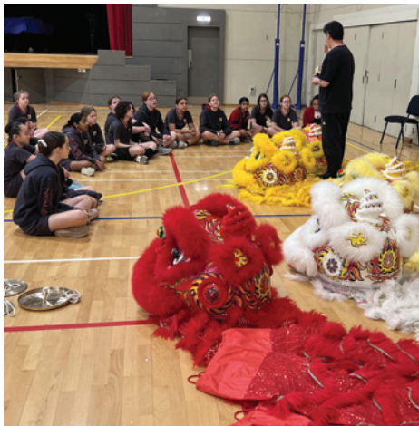
Chilton Saint James School