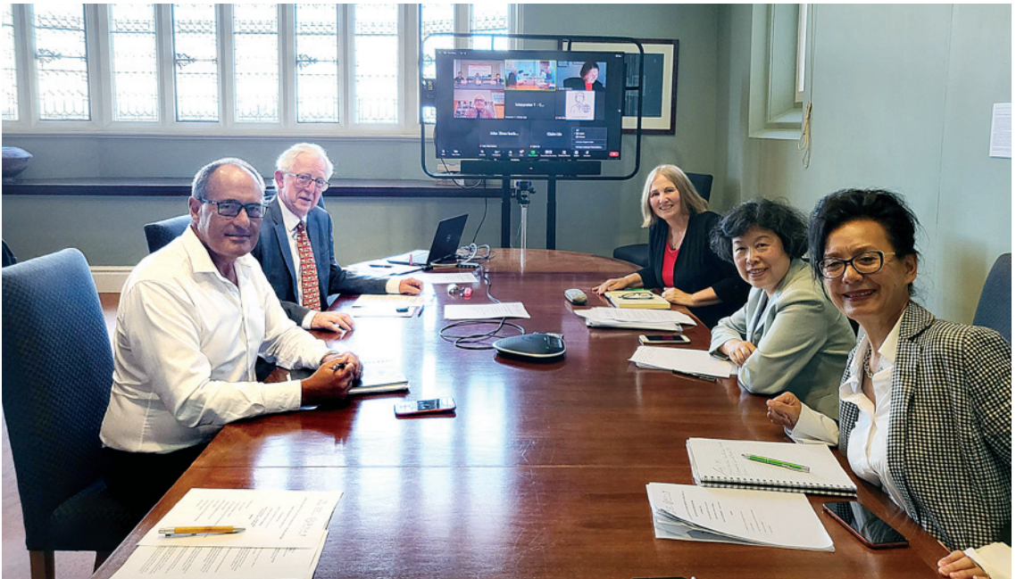
2021 Confucius Institute of Victoria University of Wellington advisory board meeting in December