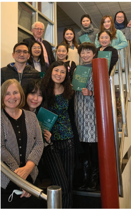
Confucius Institute staff with Wellington teachers in October

We ran a New Zealand Chinese Language Week Facebook competition and worked with the NZCLW Trust to ensure